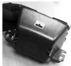
See pocket removed from panel

Remove the buttons (circled) from the old fascia and cut along the white line in order to remove the pocket from the panel itself.